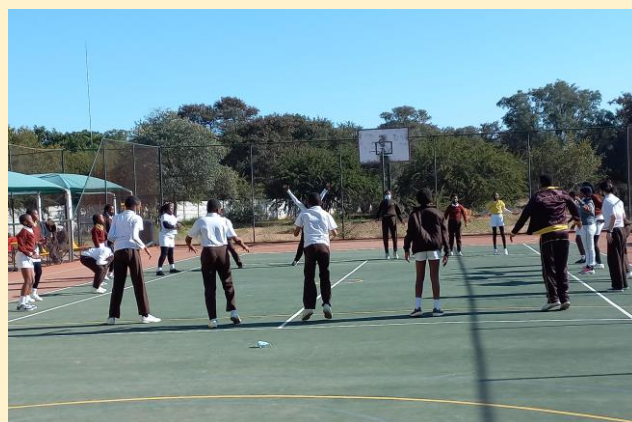
Standard 7 Physical Education Lessons