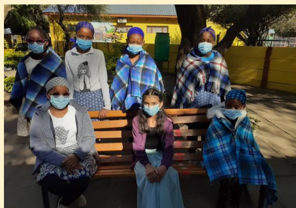
Standard 5's Celebrating Cultural Diversity