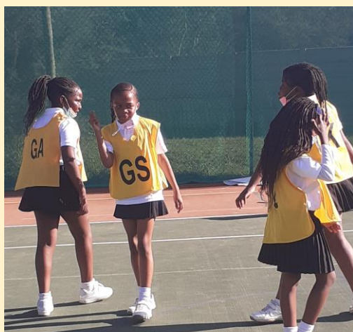
Our Netball Team ready for action