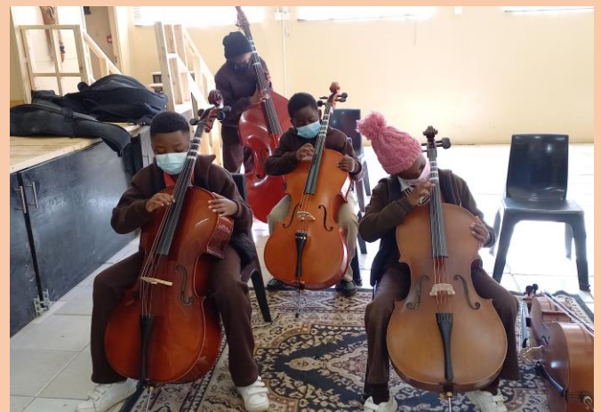
The Orchestra group getting their Cellos ready for action. The school advocates for diversity in co-curricular activities.

In July, our students will have the opportunity to see life under the sea through the use of virtual reality. Parents are encouraged to afford their children this opportunity to experience marine life virtually.