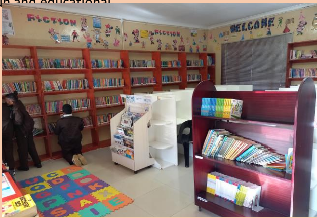
Part of our well stocked Library

The school is doing all that is necessary to make reading fun and educational.