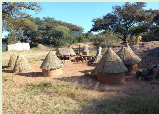
Botswana Village showcasing different houses from different Botswana Cultures

From Tuesday 31 st May, 2022, Our children started their educational trips visiting various places of interest. The school will continue to expose our children to different aspects of our diverse country.