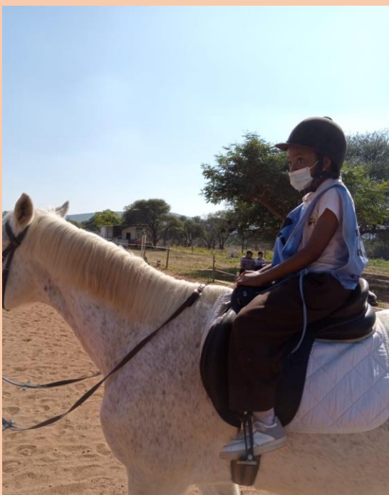
2022 Horse Riding Show