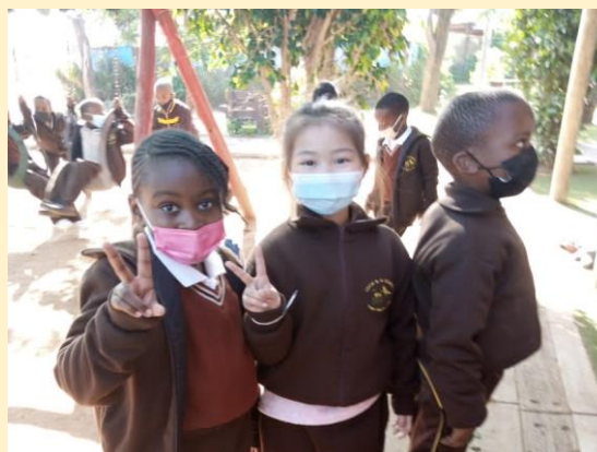
Standard 2 Outing to a Petting Zoo