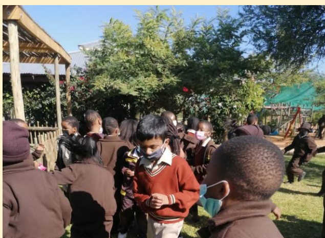
Standard 2's on a Trip