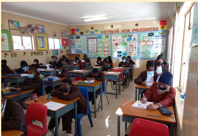
Standard 7's writing a practice test in preparation for Cambridge Check Point Exam

Legae is diverse and it encourages diversity in all aspects of the school programme. Pictures in this page showcase what the school has to offer, from academics to educational excursion. We also celebrate different cultural activities and sports.