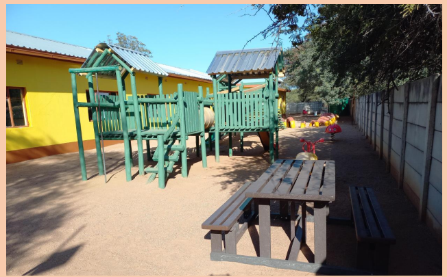
Nice outdoor tables made of re-cycled plastic