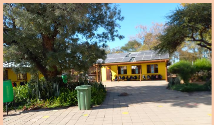
A green school! Legae supports the use of renewable energy to save and protect our one and only planet.