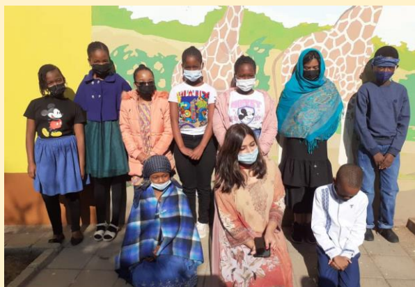
Cultural Diversity Day